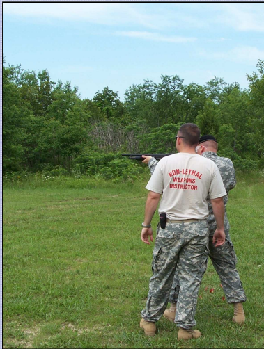
An NSLS attendee firing non-lethal rounds

Members of the Joint Non-lethal Education & Training Center (JNETC), Fort Leonard Wood, Missouri, developed the Non-Lethal Senior Leader Symposium (NSLS) to provide senior military leaders pertinent knowledge and considerations with respect to the implementation of non-lethal (NL) weapons into unit mission planning and execution. A culminating effort between the Joint Non-Lethal Weapons Directorate (JNLWD) and JNETC, the NSLS is the first step in a more robust non-lethal educational program geared towards today's operating forces.