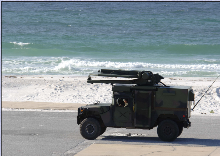
The ADS tested in a maritime scenario

Phase three of the Joint Military Utility Assessment (JMUA) was preceded by two land-based assessments. The first was held at Creech Air Force Base near Las Vegas, Nevada in August 2005, and the second was held at the McKenna Military Operations on Urban Terrain (MOUT) facility at Fort Benning, Georgia in September 2005. The JMUA events concentrated on assessing the performance of ADS in scenarios involving perimeter protection, checkpoint operations, and maneuver support of urban operations. The ADS ACTD prototype/residual will next enter an Extended User Evaluation (EUE) phase where selected units will be able to train with the system, conduct exercises and demonstrations, and continue to evaluate its day-to-day supportability and reliability factors. The ADS ACTD program is scheduled to continue through September 2007.