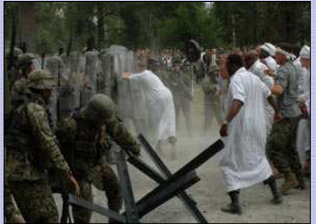
EUCOM CAPEX Training