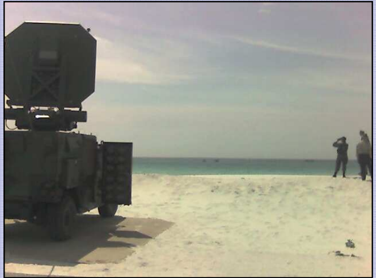
Joint Military Utility Assessment of the ADS ACTD at Eglin Air Force Base, Florida

Preparations and training began in late March and culminated with three days of scenario play on 10-12 April. On 11 April, approximately 56 government visitors observed the day's activities. Some also volunteered to participate as subjects during the land-based pier protection scenario and were able to experience the effects of the ADS beam first-hand. Detachment 1 of the Air Force Operational Test and Evaluation Command (AFOTEC) coordinated and conducted the assessment under the management of the ACTD's Operational Manager, U.S. Joint Forces Command (USJFCOM) and Headquarter (HQ) Air Combat Command Security Forces Group. All activities were conducted under human use experimentation protocols approved by the Air Force Surgeon General.