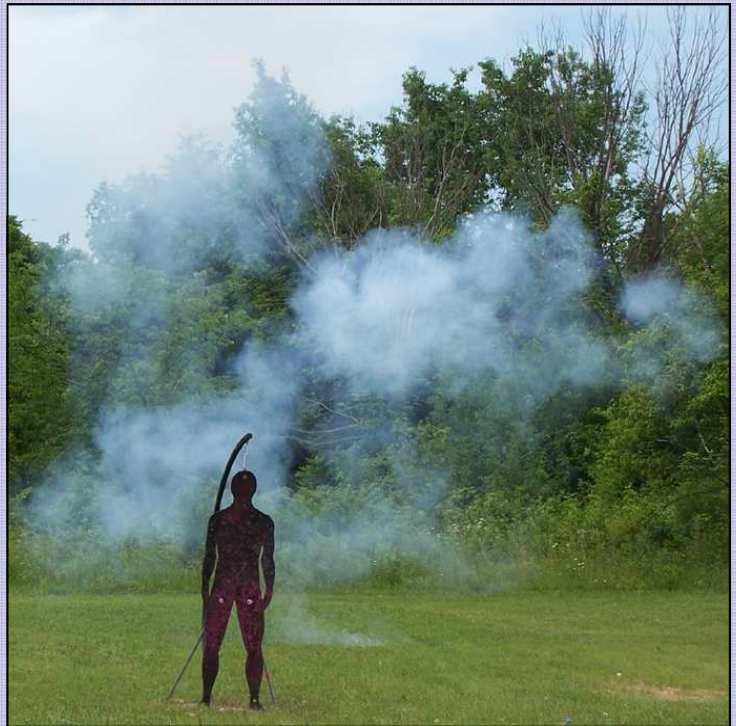
NSLS stingball grenade demonstration Official DoD Photo

While still in its infancy, the NSLS has proved a vital and viable option for today's senior military and civilian leaders ready to step beyond traditional warfare. The NSLS is expected to take place at least twice each year at Fort Leonard Wood and possibly other locations in the future. With a target audience of O4 and above for officers, E7 and above for enlisted, and GS12 and above for civilians, this education program bridges the gap between flag level awareness and operational realization. Additionally, each NSLS is focused to meet the needs of its attendees, to include briefing topics, key note speakers, and selected live fire familiarization. For more information contact Mr. Tim Minarik, at (573) 596-4356 or tim.minarik@us.army.mil